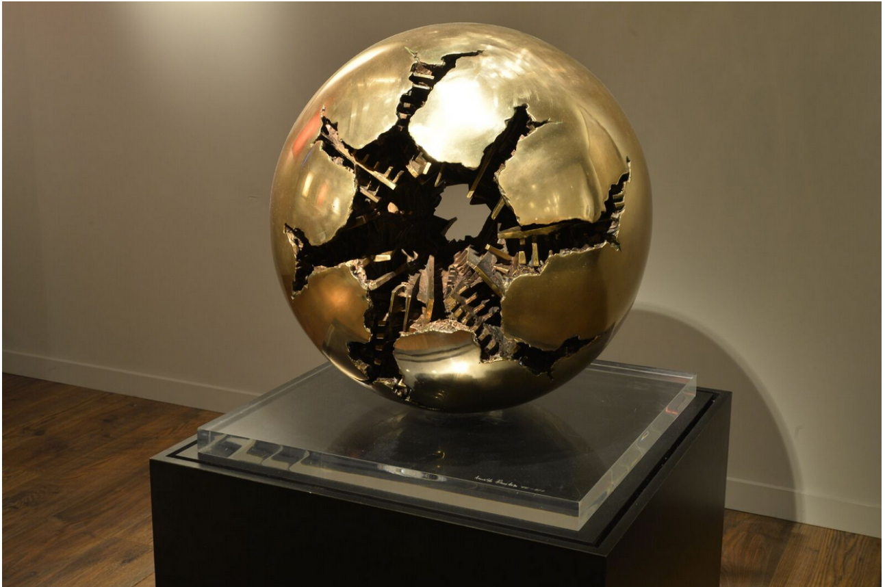
Arnaldo Pomodoro, Sfera con perforazione, Courtesy Jerome Zodo

studio. Vaadia's public works can be found at the Metropolitan Museum of Art, San Francisco MoMA, the Bass Museum of Art, and the Tel Aviv Museum. A complimentary daily shuttle service will be available between the fair and the Gardens during general show hours.