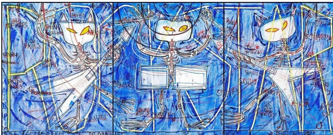
Jason Newsted, Rockstar Triptych

WEST PALM BEACH, Fla. – The Palm Beach Modern + Contemporary Art Fair, presented by Art Miami and sponsored by the City of West Palm Beach, will return January 11, 2018 for its second edition at West Palm Beach’s Tent Site (825 S Dixie Hwy & Okeechobee Blvd., W. Palm Beach) located directly behind the new Restoration Hardware.