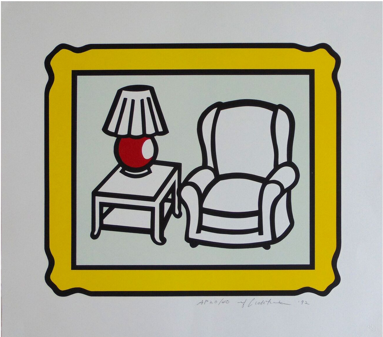
Roy Lichtenstein, Red Lamp, Courtesy Gilden's Art Gallery

Collectors, art connoisseurs and art world luminaries alike will have the opportunity to acquire investment-quality blue chip, Modern and Contemporary, and Post-War works from more than 50 top international galleries over the five days of the fair during Martin Luther King holiday weekend. These premier galleries will come from as far as Japan, the United Kingdom, France, Germany, Canada, The Netherlands, Portugal, and Venezuela. Participating galleries have previously been featured in numerous prominent international fairs including TEFAF in Maastricht and New York, The Armory Show, Masterpiece London, Art Miami, Expo Chicago, and many others.